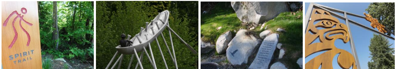
Photos of artworks currently featured on the Spirit Trail

Submission Deadline: February 22, 2013 @ 4 pm